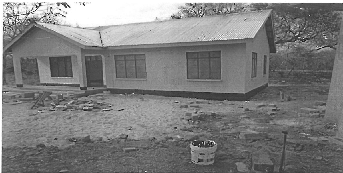
Plate 1: Renovated office at Mtambaswala

At Tanga Port: Negotiations with Tanzania Ports Authority is underway to secure a room at Tanga port buildings that will be used as office for the staff carrying out inspection. Once the room will be secured, Wildlife Division will meet the renovation prior to deploying staff.